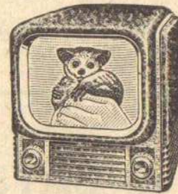
BUSH 14in. Tube